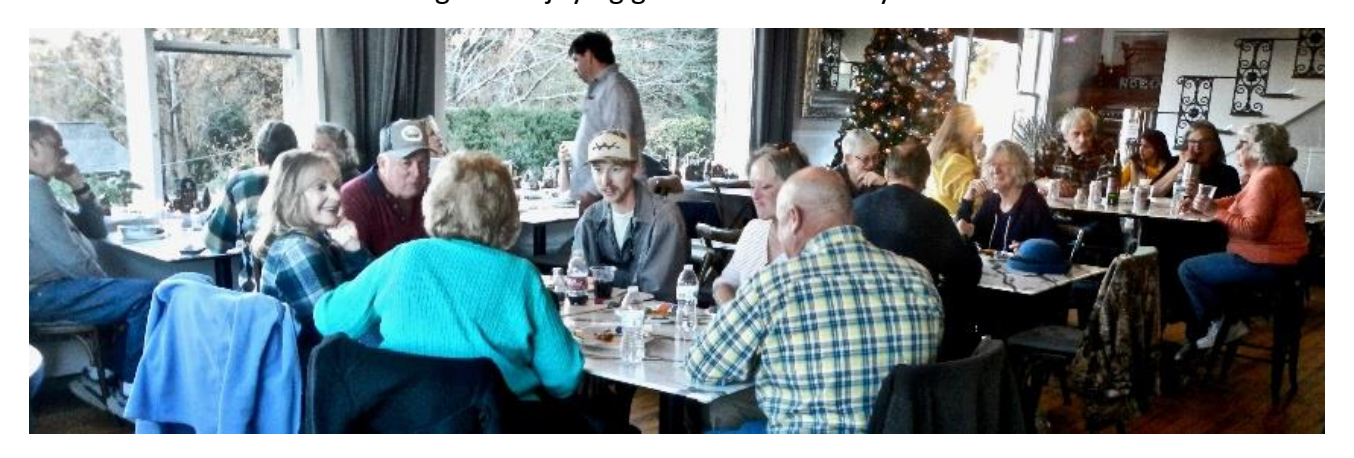
Visiting and festivities carried on into the night outdoors at the fire pit. Sunrise on Saturday morning accompanied breakfast supplied by Echo Mountain Inn.