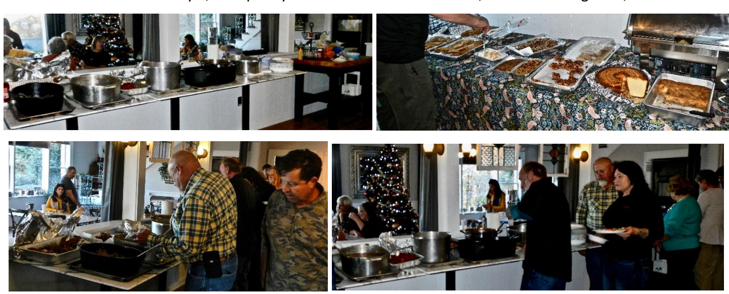
Socializing and enjoying good food on Friday afternoon.

Dinner was served buffet style, with plenty of food for the 35 or so folks, members and guests, in attendence.