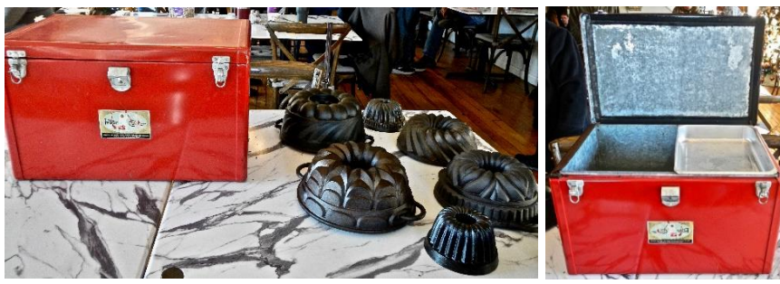
Traditon was altered a bit this year. Those who brought show and tell items got to explain and demonstrate what they had brought, rather than have a panel of 'experts' talk about them.