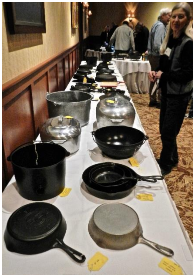
Folks previewing some of the auction items