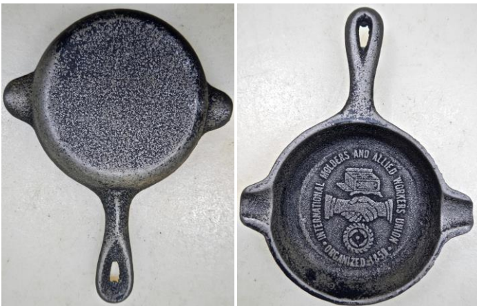
#1-PLAIN BACK; IMAGE READS WITH HANDLE UP