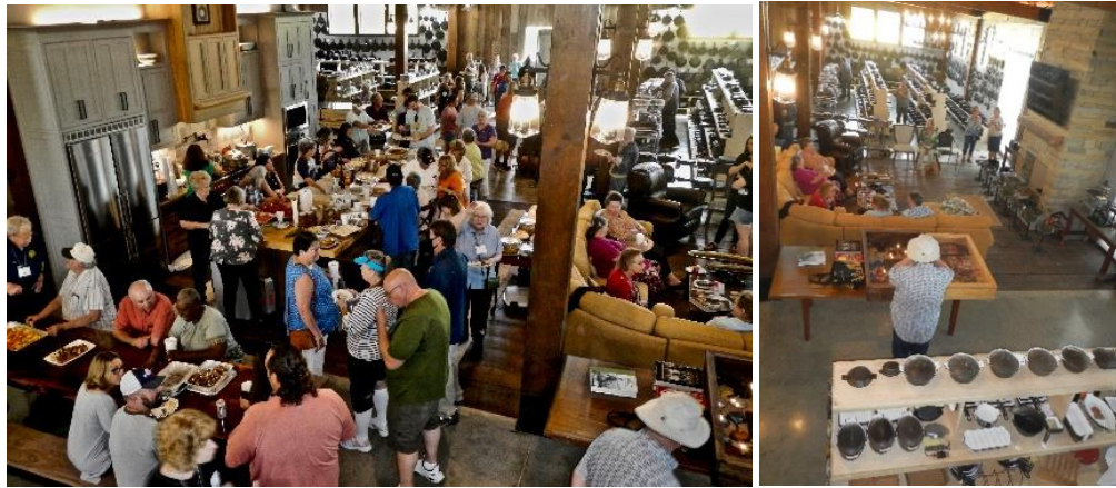
Kitchen and dining area within the museum offering a plethora of hors d'oeuvres, hot food and desserts