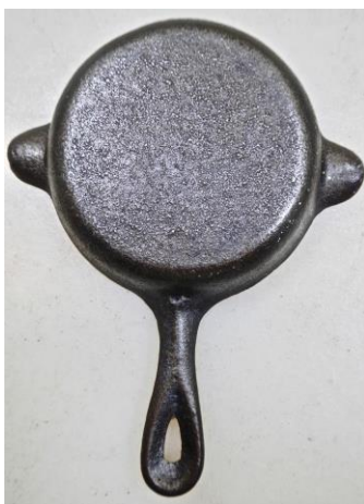
#1-PLAIN BACK; IMAGE READ WITH HANDLE DOWN