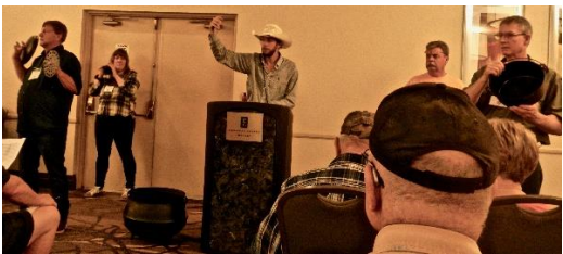
Plenty of action and a lively time!