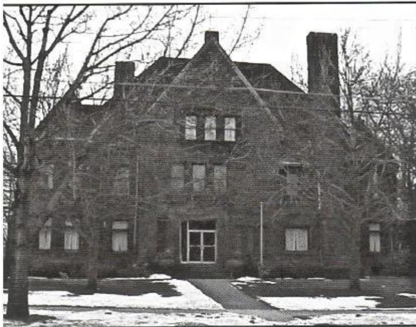
The Watson/Curtze Mansion