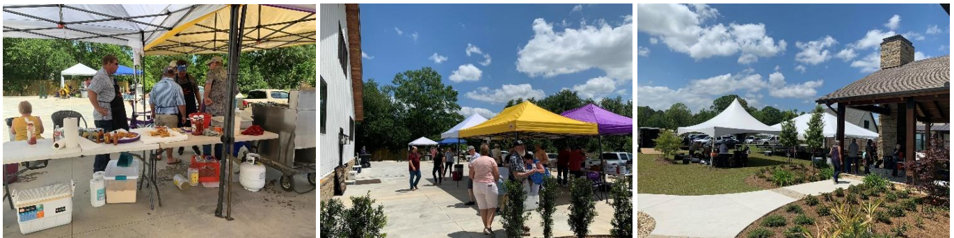
Outdoor cooking and seating areas. Catfish was just one of the offerings.