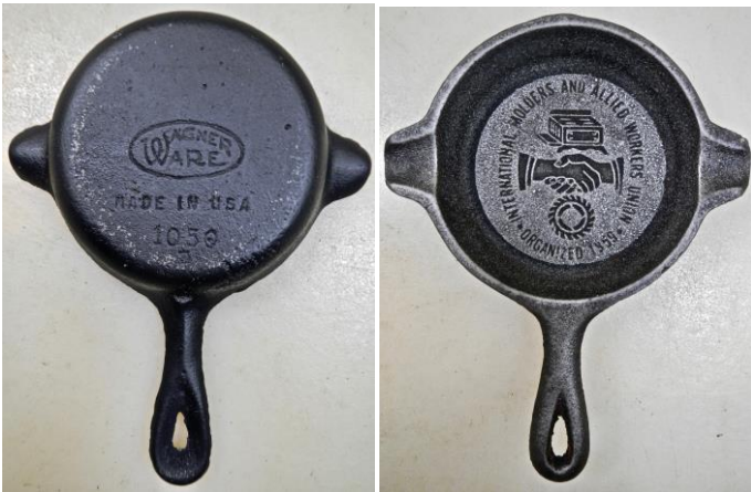
#3-OVAL LOGO, MADE IN USA, 1050; IMAGE READ WITH HANDLE DOWN