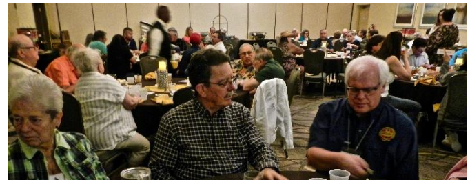
The banquet was enjoyed by all, both for the food and the socialization.