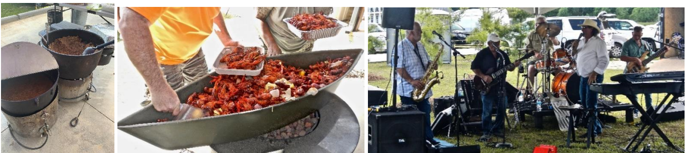
Giant pots of beans and chili, one of many pirogues of crawfish (mudbug) boil, and a band for entertainment