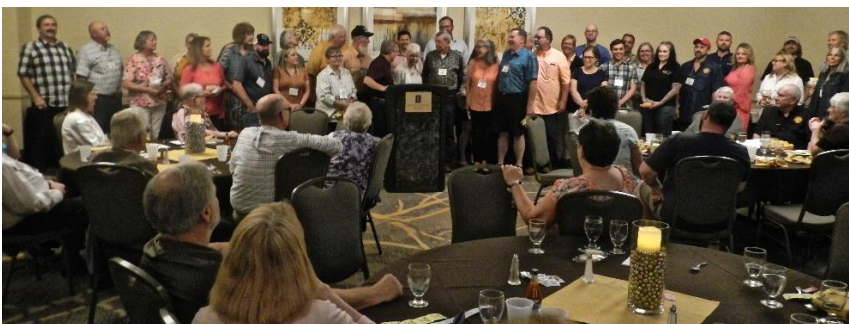
New members and first-time convention attendees were recognized and applauded.