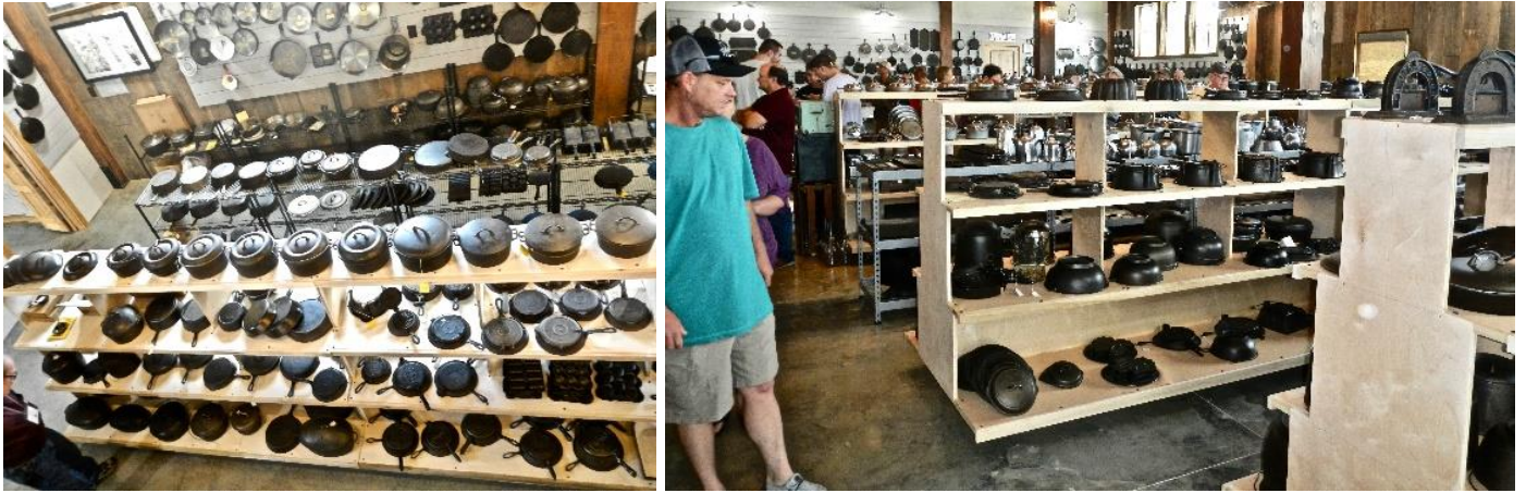
These photo are just a small sampling of the beauty and variety, and often rarity, of iron in the museum