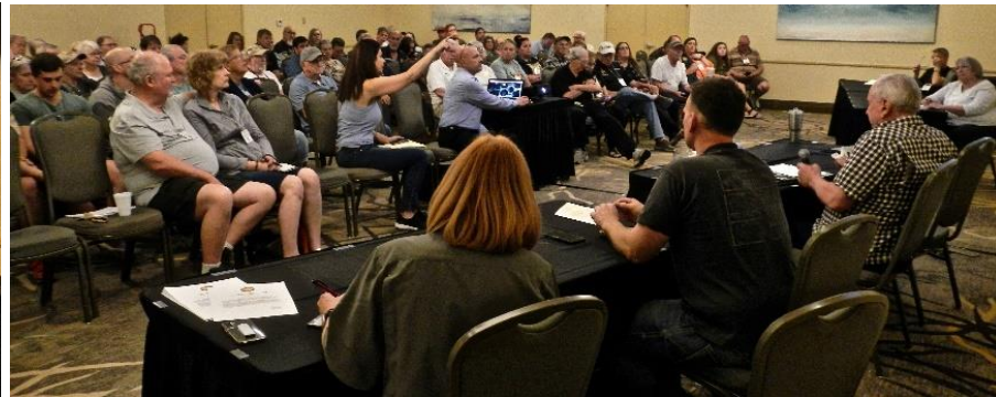
Bruce solicited input regarding the web page from the members.