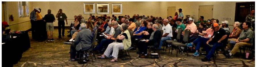
There was good attendance, as usual, for the auction.