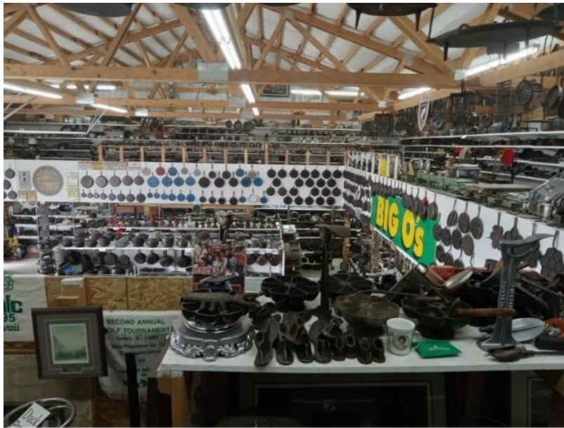
The O'Neil Museum