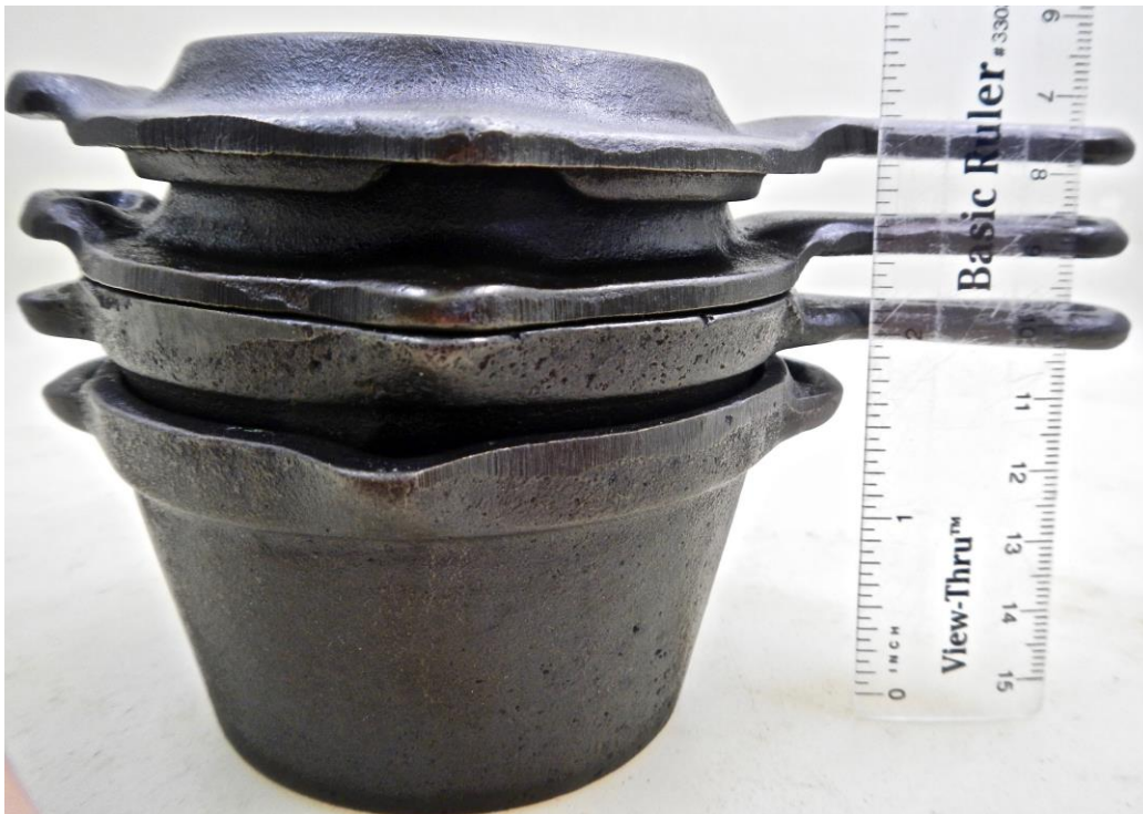
The four pieces of the toy Jones set stacked and nested

The set consists of a shallow skillet/lid, a deep skillet/lid, a chicken fryer and a bottom pot.