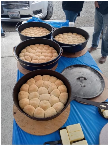
NW Dutch Oven Society baking rolls