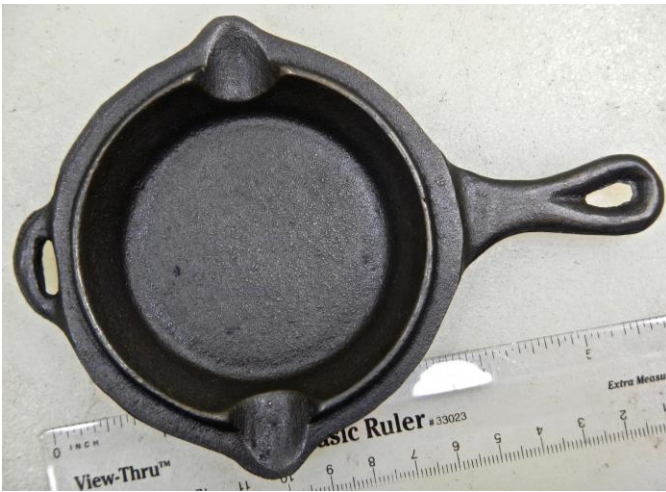
Toy Jones shallow skillet/lid