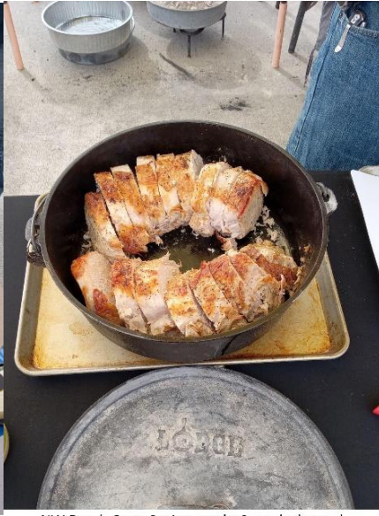
NW Dutch Oven Society cooks Saturday's meal