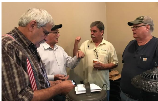
Discussion at show and tell