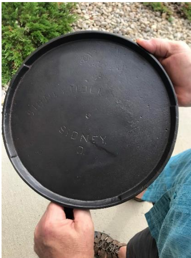
Sidney Hollow ware griddle with three markings