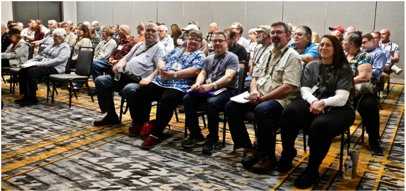
Membership attendance at the business meeting