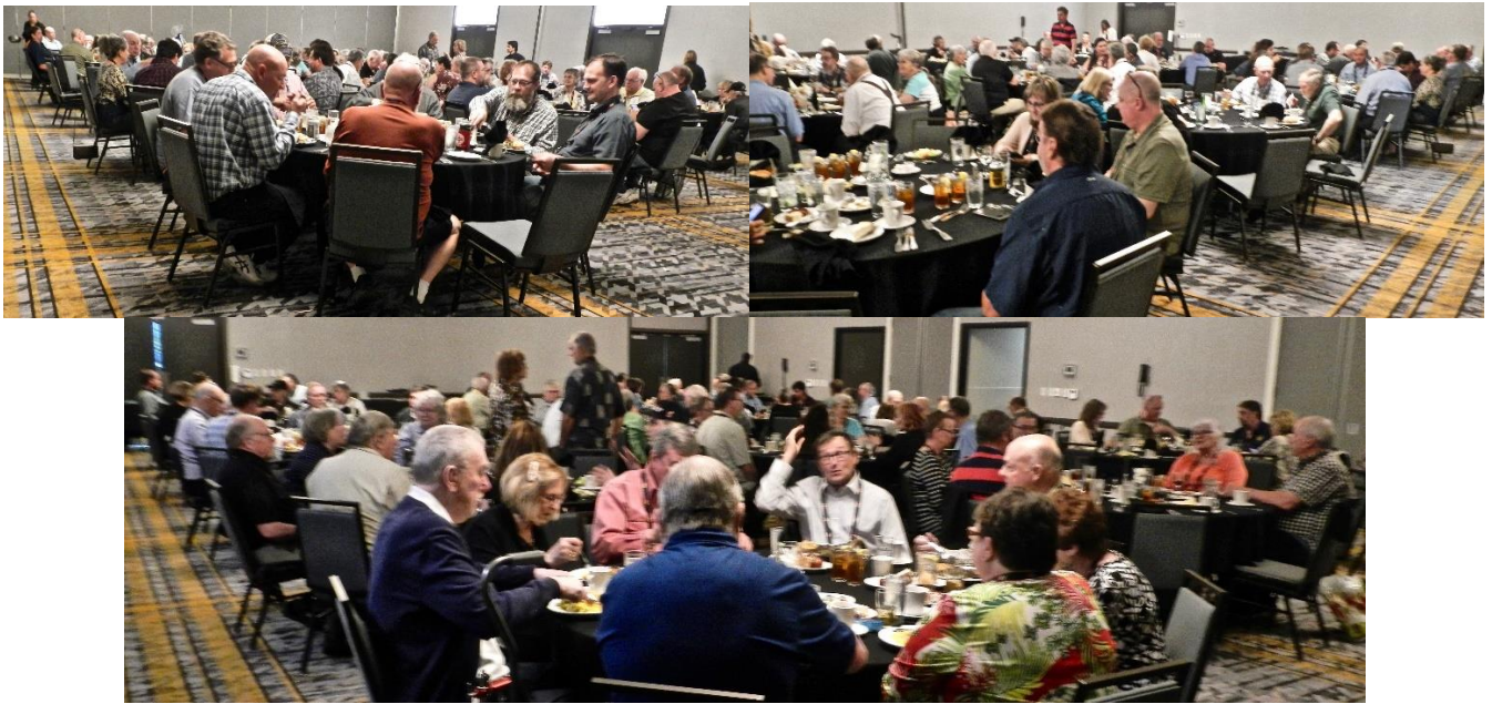
The Saturday night banquet was enjoyed by all