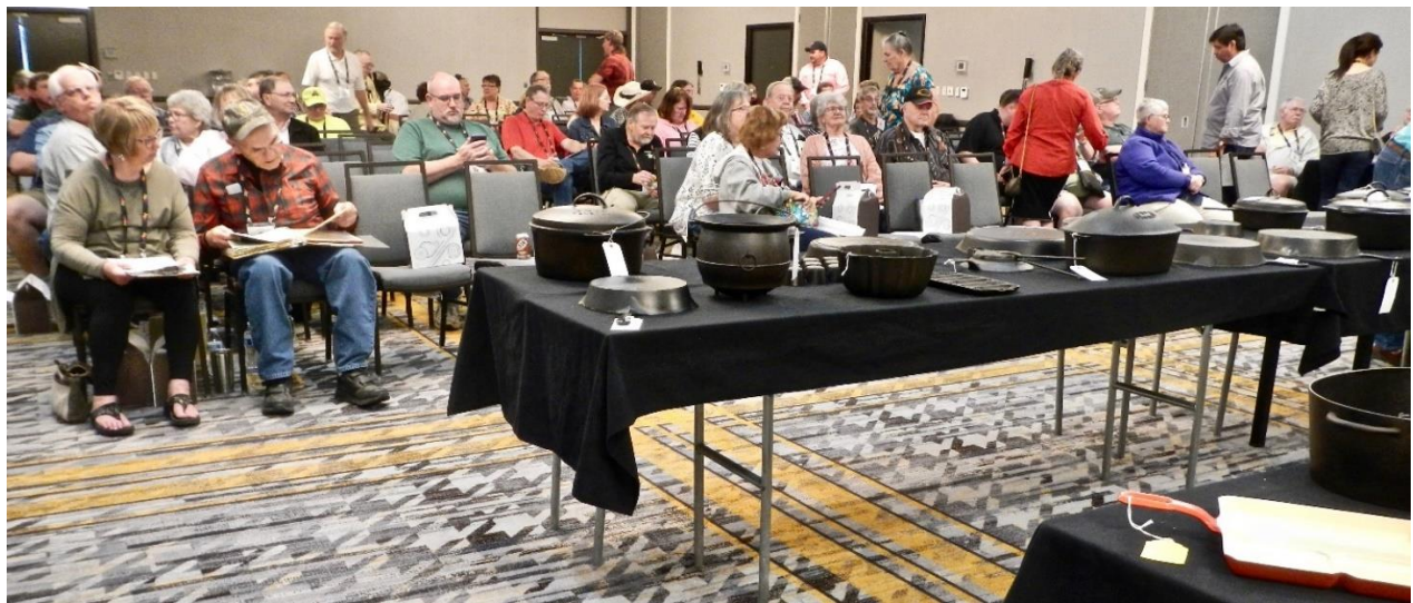
Getting ready for the bidding to commence