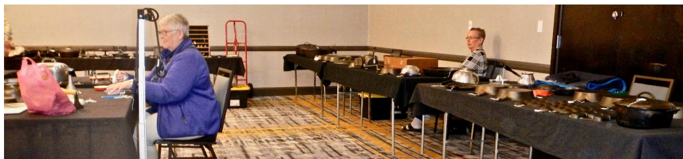
The swap meet offered plenty of variety, choices, bargains, deals and negotiations for all to enjoy.