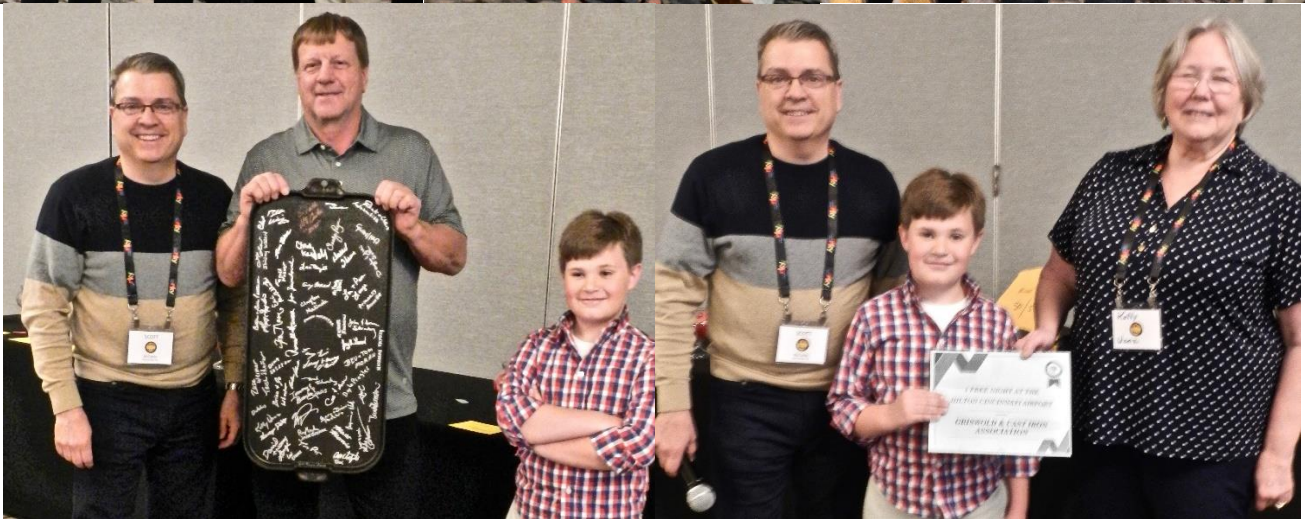
Some of the raffle winners