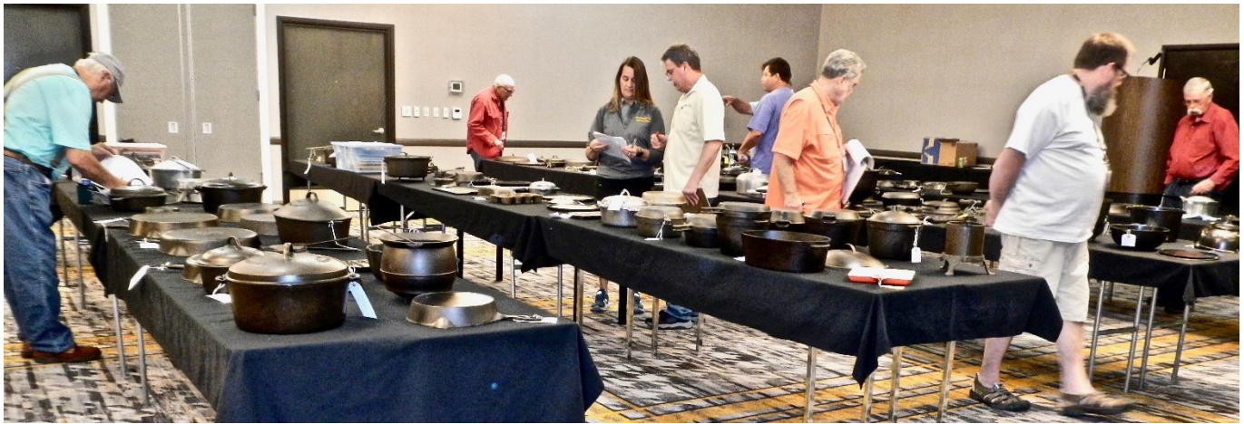
Association members preview the 146 items entered in the auction