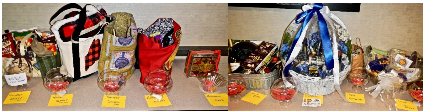
Some of the goodie baskets donated by our regional chapters